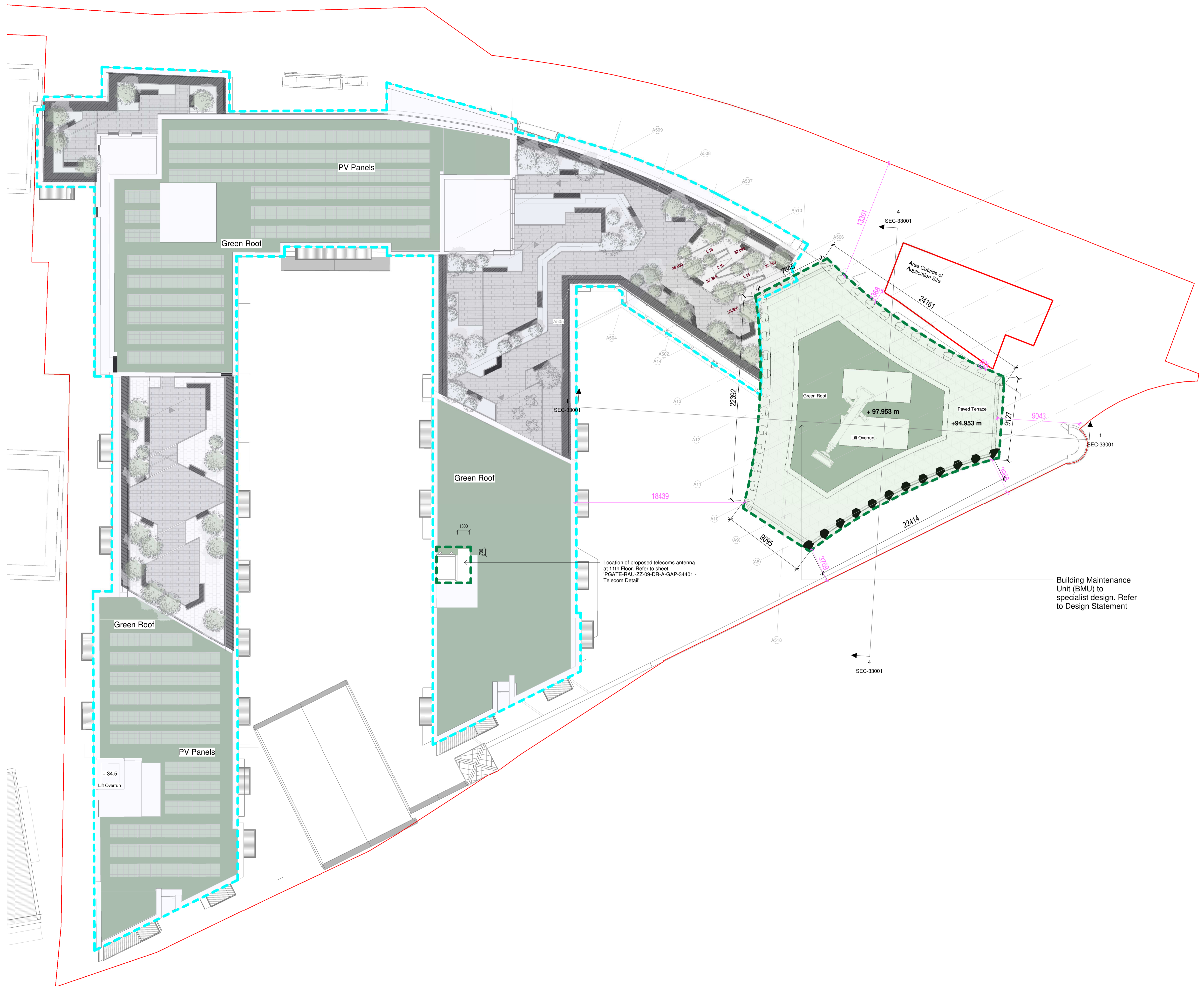
Proposed Roof Plan 1 : 200